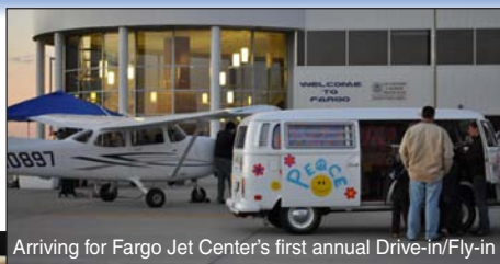
Arriving for Fargo Jet Center's first annual Drive-in/Fly-in