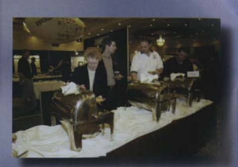
Good food was had by all Monday at Exhibitor's Night.