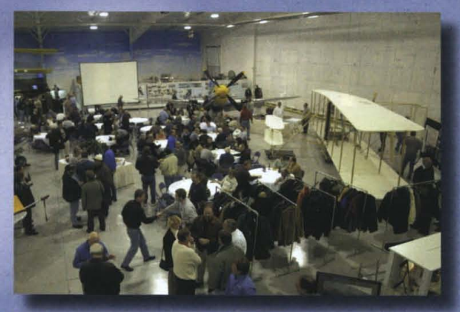
Sunday night's Ice Breaker was held at the Fargo Air Museum.