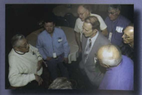
Scott Crossfield, "Man of Speed," holds court Tuesday morning with many of the breakfast guests.