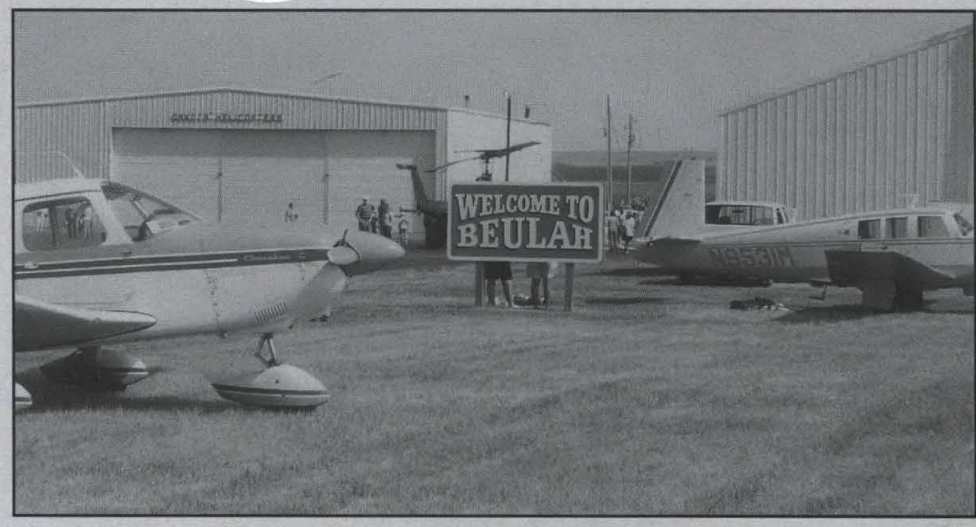
Fliers and visitors from throughout the region were welcomed to Beulah's airport on June 13th for their annual fly-in.

NDAQ NEXT DEADLINE OCTOBER 1<sup>st</sup> DON'T BE LATE!