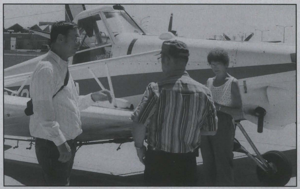
Warbirds were not the only aircraft by any means on July 26th at the Aeronautics Commission's 50th Anniversary Celebration. Here, three visitors compare notes by a Piper "Pawnee" agricultural application

The fly-ins? How much more exciting than joining 57 pilots from all over the country following the Lewis and Clark Trail? The North Dakota Pilots Association joined the