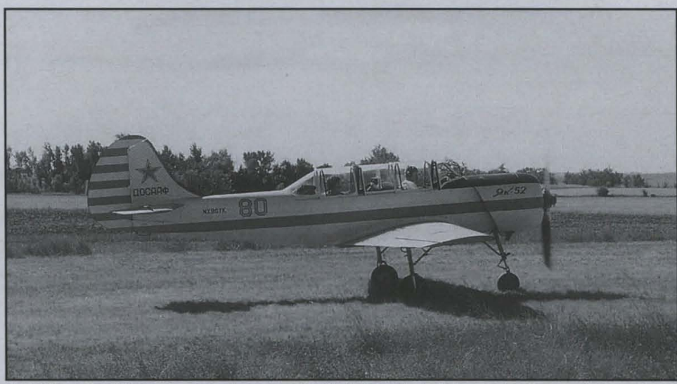
A 1990 Soviet YAK-52 taxies at the September 21st Turtle Lake Fly-in. It is owned by Jessie and Aimee Hamel of Lansford, ND.

Also scheduled to join the UND fleet in early 1998 are two all-weather, twin-engine training aircraft. These all-weather twins will be used in the UND Aerospace Spectrum® ab initio airline pilot training curriculum for both collegiate and contract students. The allweather capability will provide better dispatch reliability in the winter months and allow students to train in and experience flight conditions that will better prepare them for airline careers. The Spectrum® ab initio airline program features LOFT (line oriented flight training) and crew-training concepts that have student pilots fly airline style-missions. All-weather dispatch capability enhances the value of this type of training.