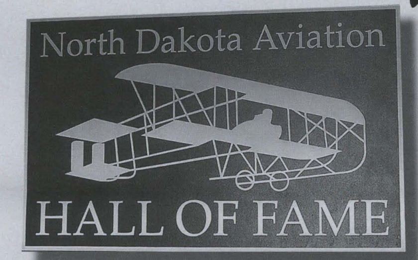
The North Dakota Aviation Hall of Fame's logo plaque graces the center of the Hall of Fame's new site at the Bismarck Municipal Airport.

Fifteen years later I met a man who was to become a very good friend. He had been pro-(Continued on back page)