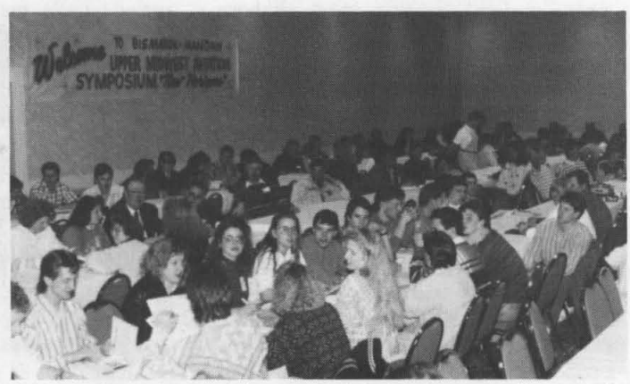
311 students in attendance at Aviation Careers Day at the Symposium.