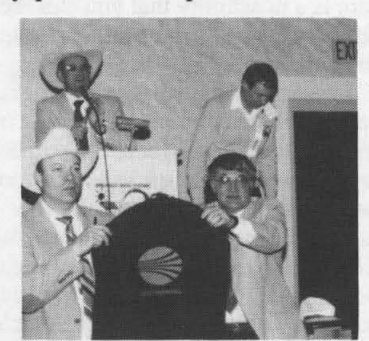
Auctioneers selling items at the Casino Night Auction during the Symposium.

Have a safe and successful spray season as the "rains in the plains help spray profits for airplanes".