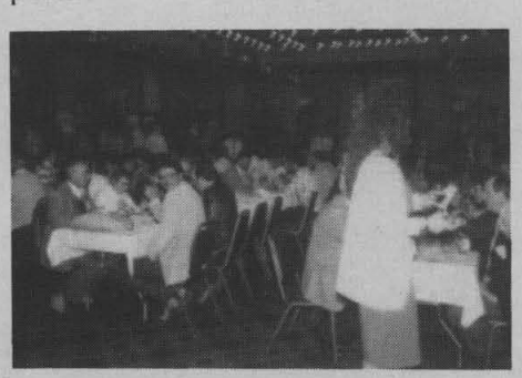
International Night proved to be a big success at the 1988 convention.

We guarantee you'll enjoy our informal but dedicated aviation oriented organization just for the "Lady Pilots" of the area. Don't let another summer go by without the companionship of other lady pilots!!